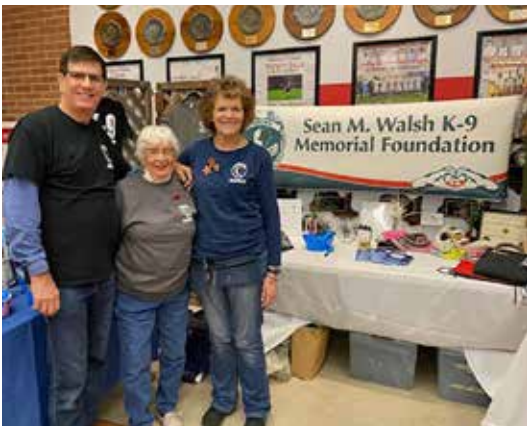
The Sean M. Walsh K-9 Memorial Foundation raises funds to provide grants to law enforcement agencies for their K-9 teams.