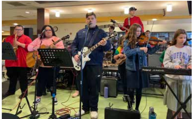
Perform 4 Purpose takes the stage.