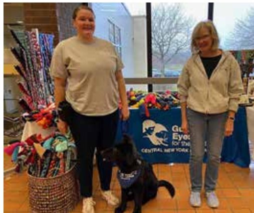
Guiding Eyes for the Blind puppies in training.