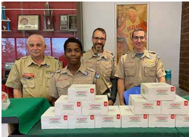
Troop 21 Scouts and Krispy Kream donuts greeted customers and vendors at the 48th annual Craft Fair.