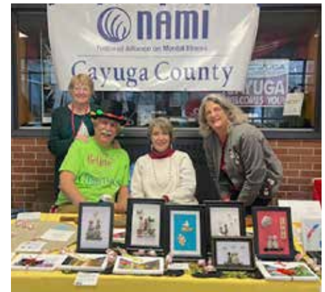
NAMI of Cayuga County raised awareness and funds at the Craft Fair.