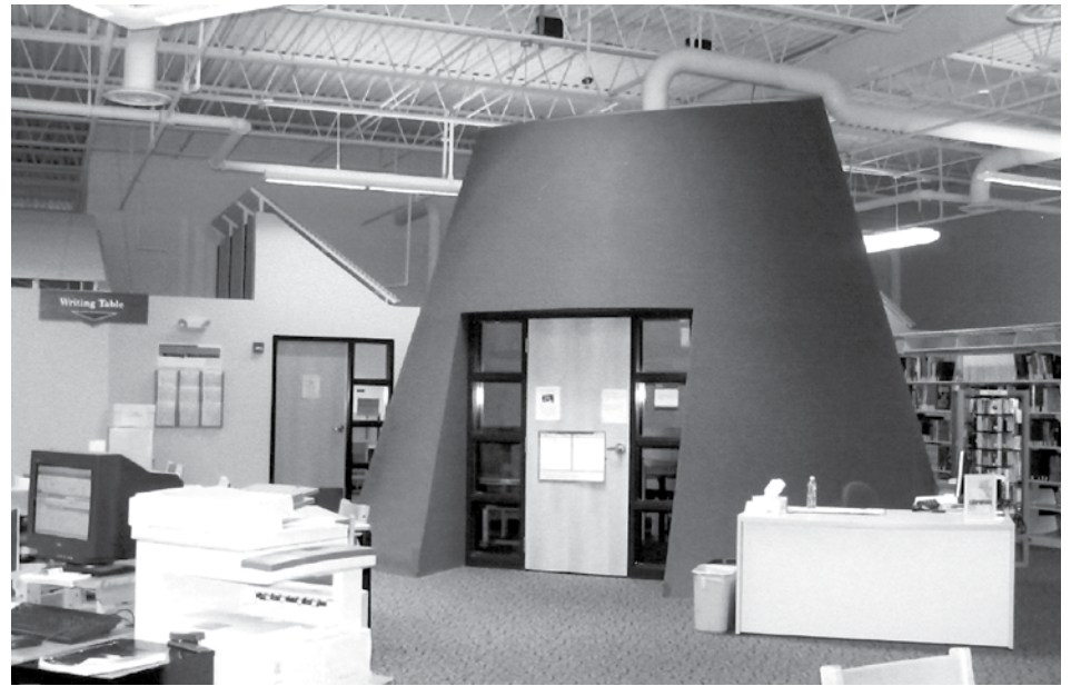
‘Cone of Silence’ in the Fulton Campus Education Center.

Cayuga Community College has prepared thousands of students in the Greater Oswego County area for transfer to four-year institutions and for entering or re-entering the workforce. Twelve years ago when the Fulton site was established, no one could have predicted that it would explode into the current enrollment of 1,100 students. Like a growing child, it has outgrown its buildings twice, moving from two rented classrooms in the basement of the Fulton Education Center with 97 students to the former Holy Family School, and eventually