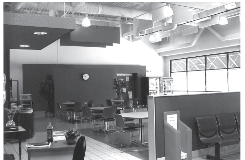
The New Student Lounge at the Fulton Campus.

to its current site in the Pyramid Mall, Route 3, in the city of Fulton.