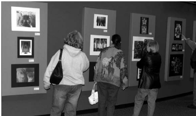
Exhibit of Student Artworks at Fulton Campus