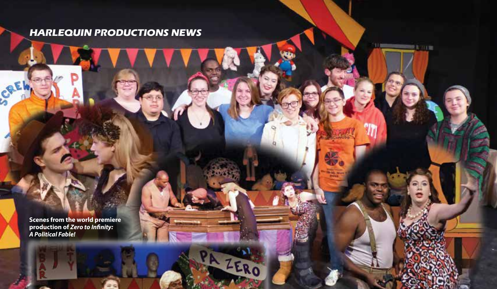
Scenes from the world premiere production of Zero to Infinity: A Political Fable!