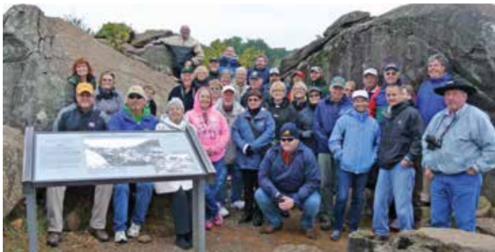
The "Unseen" Travelers