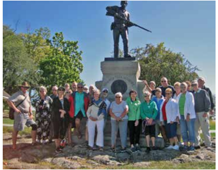
Traditional Gettysburg Battlefield Trip Travelers